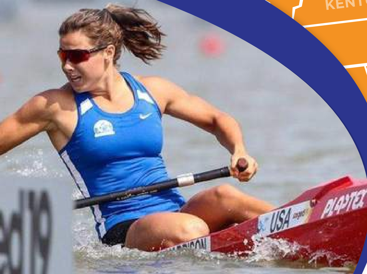
Sprint Canoe Women's World Champion, Nevin Harrison